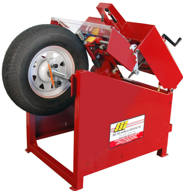
ST Saf-Tee Siper shown with optional 6030 Quick Mount Adapter